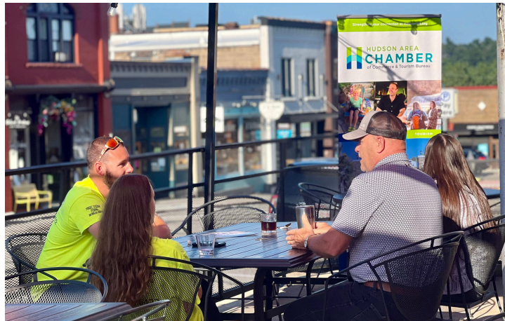
Chamber members soaked in the sun on the beautiful patio at Post - American Eatery. ■