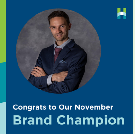
Congrats to Our November Brand Champion

The Zone , located at 707 Rodeo Drive, is launching a new program in the new year. Thrive Zone for Business is a program aimed at smaller businesses to help recharge their team and boost energy, cut stress, and supercharge productivity! They will customize a program specific to your needs. The program includes a customized app, gamification, body composition tracking, nutrition coaching, and more. For more information, check out their website or give them a call at 715-864-6981. ■