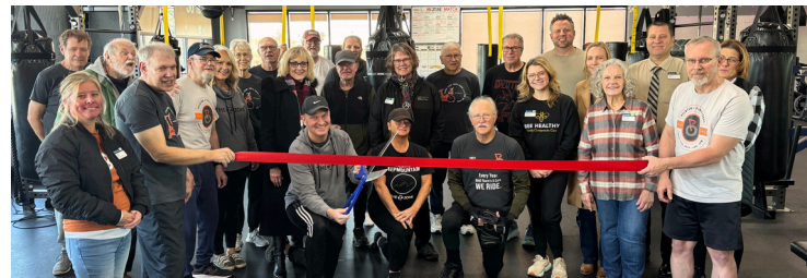
The Zone – located at 707 Rodeo Drive, Hudson. They build strength and community through fitness. Congratulations on your new location!