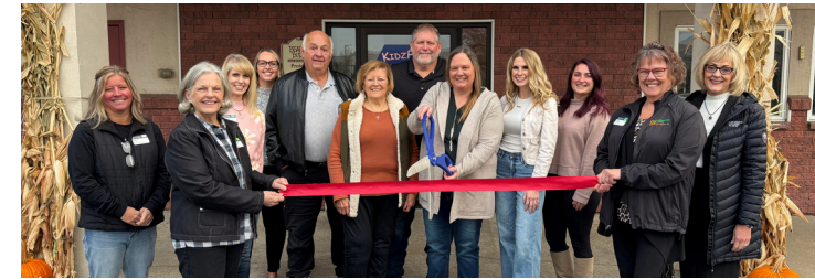
Bear Buddies Child Development Center - located at 3250 Heiser Street, Hudson. They foster a nurturing environment that supports a child's social, emotional, language, cognitive, and physical growth. Welcome to the Chamber!