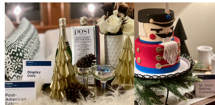
Businesses and homeowners worked together to create dazzling displays for our weekend.