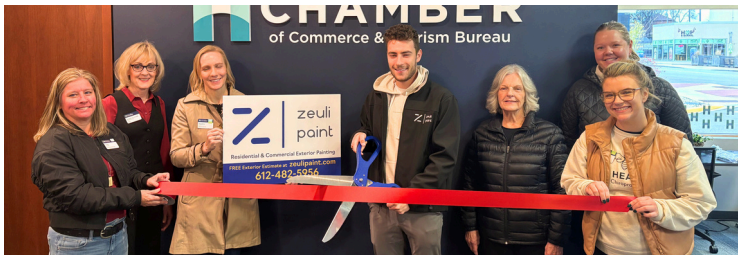
Zeuli Paint – located at 619 2nd Street, Unit 2A, Hudson. They offer both interior and exterior painting services to meet all your needs. Welcome to the Chamber!