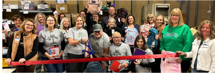
The Sharing Tree – located inside the WESTconsin Credit Union building at 1601 Maxwell Drive, Hudson. They provide school supplies to Hudson and Somerset students in need and their educators. Welcome to the Chamber!