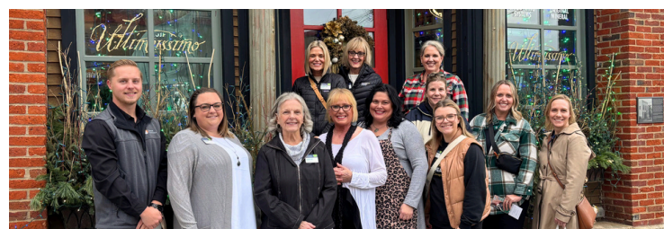
Ultimissimo - Boutique Salon – located at 112 Walnut Street, Hudson. The Ambassadors stopped by Ultimissimo for a retention visit. Ultimissimo has 22 years of experience and is renowned for its family-friendly environment, professionalism, and commitment to using clean and healthy products. Thank you for your long-time investment and involvement in the Chamber!