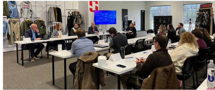
Leadership Hudson: Business & Industry/Economic Development was the topic for the November class. Students toured the St. Croix Innovation Center hearing from a panel of business owners of the center. In the afternoon, the class toured Striker Brands and spent time with housing and economic development professionals.