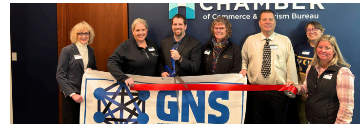
Genius Network Solutions - based out of Hudson. They offer the Working Genius Model to help inspire teams to connect their passions to their work. Welcome to the Chamber!