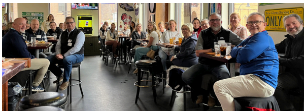
Thank you to everyone who joined us at Agave Kitchen in November!

Date: Wednesday, December 18 | Noon Location: Pedro's Pizza Lounge, 212 Walnut Street To Register, click here.