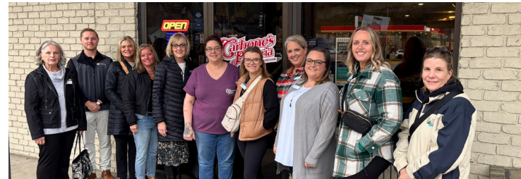
Carbone's Downtown Hudson – located at 207 Second Street, Hudson. The Ambassadors visited Carbone's for a retention visit. They offer premium pizzas, pizza sandwiches, hot hoagies, salads, appetizers, wraps, cold drinks, and ice cream. Thank you for your continued support of the Chamber!