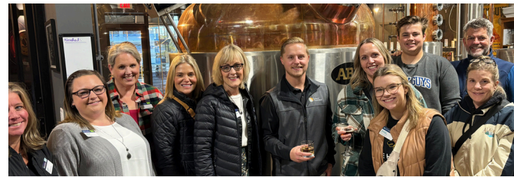
Lucky Guys Distillery – located at 101 Second Street, Hudson. For a retention visit and their monthly meeting, the Ambassadors stopped by Lucky Guys Distillery. They are a microdistillery and cocktail bar with their own line of vodka, gin, whiskey, and bourbon. Thank you for your continued support of the Chamber!