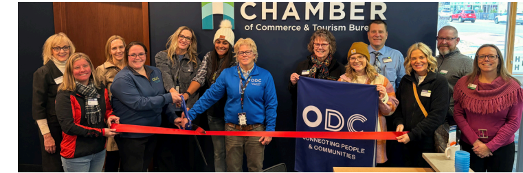
Opportunity Development Centers - 1091 Sutherland Ave, River Falls. Their mission is to empower people with disabilities to achieve their work and life goals. ODC offers customized services for individuals with disabilities from early years throughout adulthood.