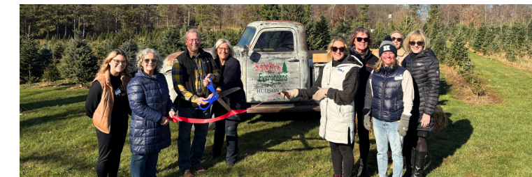
Santa's Evergreens - located at 615 Northern Lights Trail, Hudson. They are a family-owned business built with an appreciation for superior quality, excellent customer service, and warm Christmas traditions. Their farm has 8 to 10 thousand trees, along with custom designed wreaths and porch pots. Welcome to the Chamber!