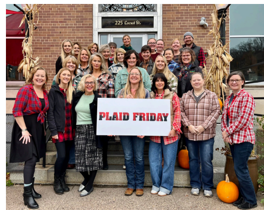
Thank you to everyone who participated in Plaid Friday!

Bring your list to visit with Santa at Thorcraft Custom Kitchens, LLC located at 512 2nd Street in the 2nd Street Crossing building. Bring your camera for photos with Santa.