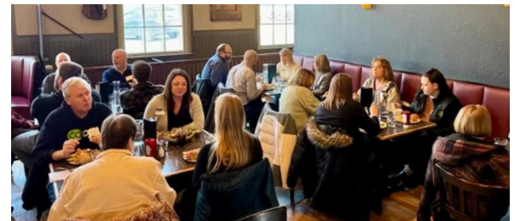
Thank you to everyone who joined us in January at Post - American Eatery ; delicious food and amazing conversations were had by all.

Date: Wednesday, February 26 | Noon Location: TBD