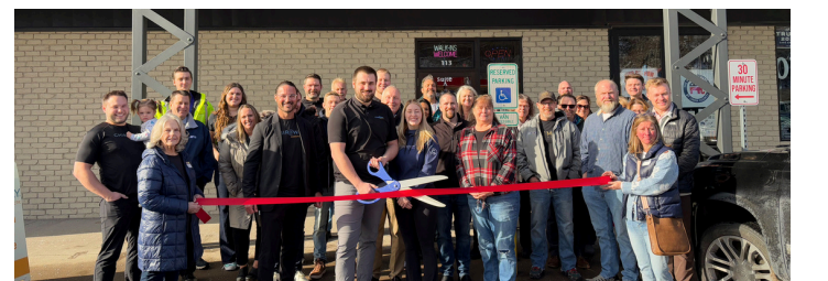
ChiroWay Chiropractic of Hudson - located at 113B 2nd St., Hudson. They provide convenient, affordable, and locally owned regular chiropractic care with walk-ins welcome and minimal wait time. Welcome to the Chamber!