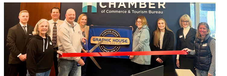
Graphic House, Inc. - located out of Hudson. They design, fabricate, install, maintain, and repair custom signs of all sizes and complexities throughout the Midwest and nationwide. Welcome to the Chamber!