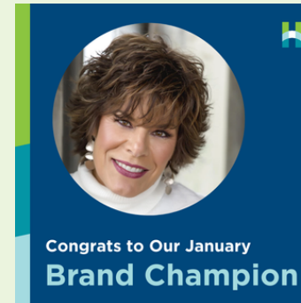
Congrats to Our January Brand Champion

Please consider becoming a lane sponsor or team captain or donating an auction item for this wonderful event. Call BRIDGE at 715-381-8230 or email at info@bridgecl.org to get started. The kindness and generosity of individuals and organizations in this community are core to the BRIDGE mission of providing lifelong learning opportunities for youth and others with disabilities. For more information visit www.bridgecl.org/bowlarama