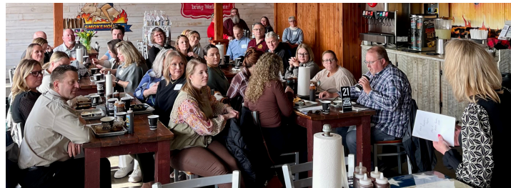
Thank you to everyone who joined us in February at Old Southern BBQ Smokehouse ; delicious food and amazing conversations were had by all.

Date: Wednesday, March 26 | Noon Location: Keys Cafe & Bakery To Register, Click Here .