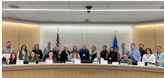
The Leadership Hudson Class had their Government/Leadership Development day in February. They learned about local government and county services, toured the fire department, and heard from municipal leaders. Pictured is the class in the St. Croix County Government Center Boardroom.

Thank you for your continued involvement and commitment. ■