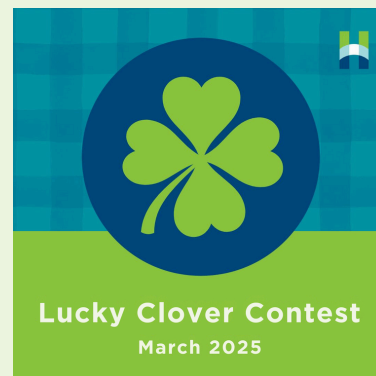
Lucky Clover Contest March 2025

Participate in the Lucky Clover Contest: as you shop, dine, and live locally in Hudson, bring your card to participating businesses. With a $10 minimum purchase, you will get a sticker placed on that business name. Lucky Clover Cards with 5 stickers or more will be entered to win gift cards and prizes from your favorite shops and restaurants in Hudson.