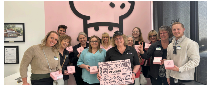
Crumbl Cookies Hudson - 1020 Pearson Drive, Hudson. The Ambassadors visited Crumbl Cookies Hudson. Crumbl specializes in a weekly rotating menu of 6 delicious gourmet-flavor cookies. Through the summer, they will be offering mini versions of their cookies on Mondays. Stop in or drive through!