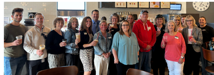
Dunn Brothers Coffee - 2521 Hanley Road #100, Hudson. The Ambassadors visited Dunn Brothers Coffee! Dunn Brothers roast their coffee beans daily in small batches in-store. Also offering a variety of beverages and food, stop in for your next meal, or drive through for a quick snack.