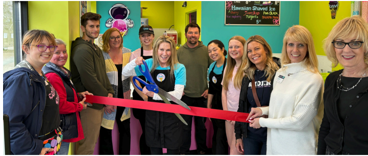
Dipsy Ice Cream Shoppe - 115 Commercial Street, Hudson. Dipsy Ice Cream Shoppe is conveniently located right by Lakefront Park and offers homemade waffle cones, shaved ice, and a wide variety of Bridgeman's Ice Cream flavors. Congratulations and welcome to the Chamber!