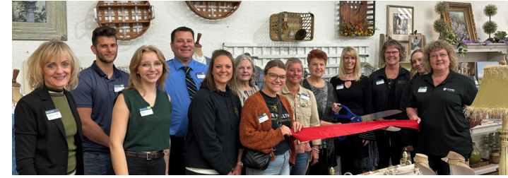
Vintage Vogue Cottage - 412 2nd Street, Hudson. Vintage Vogue Cottage offers repurposed and new décor to enhance the everyday spaces that surround you. Welcome back to the Downtown Hudson community, Jule!