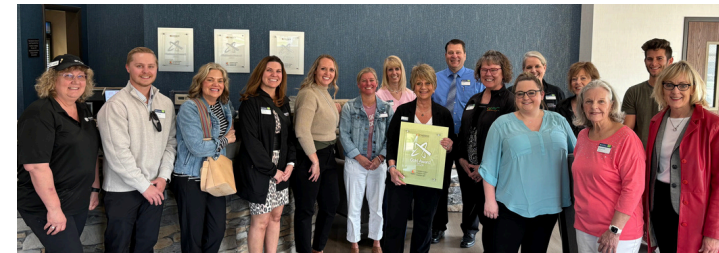
Comfort Suites Hudson - 2620 Center Drive, Hudson. The Ambassadors visited Comfort Suites Hudson. Recently remodeled, Comfort Suites features superb service and amenities.