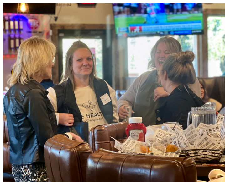
Attendees had the opportunity to network and connect with a variety of fellow Chamber members.