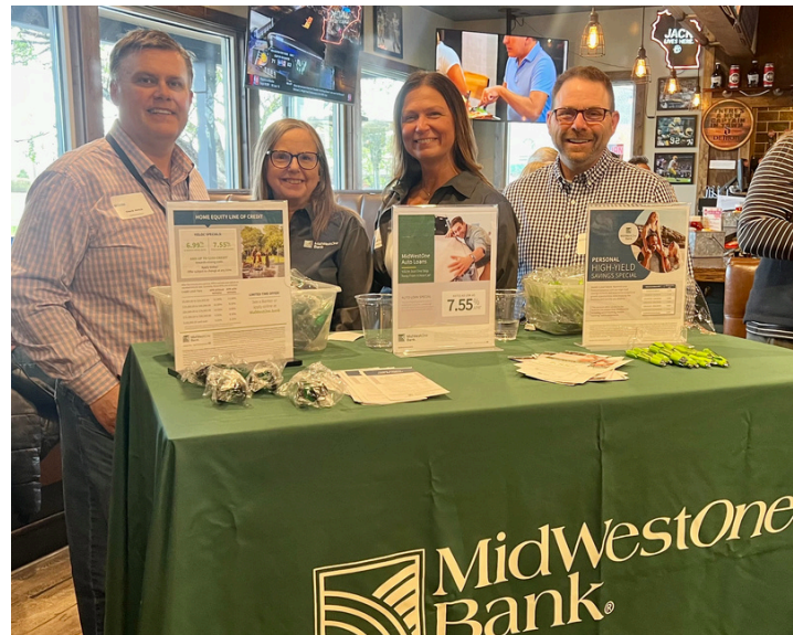
MidWestOne Bank had an awesome team at the event to connect with attendees.

Thank you to everyone who came out to our Simply Connect PM event on Tuesday, April 23! It was a great evening full of fun, fellowship, and food. Thank you to MidWestOne Bank for sponsoring this event and making it possible. Thank you to the Milwaukee Burger Company for hosting and providing delicious appetizers, including their specialty cheese curds.