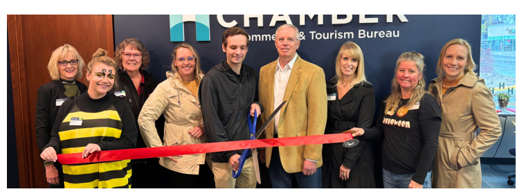
Inter-County Cooperative Publishing Association – based out of Frederic, Wisconsin. They are in business to publish newspapers and shoppers in a manner that provides fair, honest, and accurate information; and to sell office supplies, quality printing, and offer any related services. Welcome to the Chamber!

Thanksgiving is a great time to reconnect with loved ones and eat delicious food, however, during the Thanksgiving season, there is an estimated over 300 million pounds of food waste annually. To help cut down on the food going into landfills, make sure to save leftovers! Food that is properly stored or frozen is edible for much longer. Additionally, plan ahead and get just enough food for everyone. Leftovers that have gone bad can be composted to support soil health.